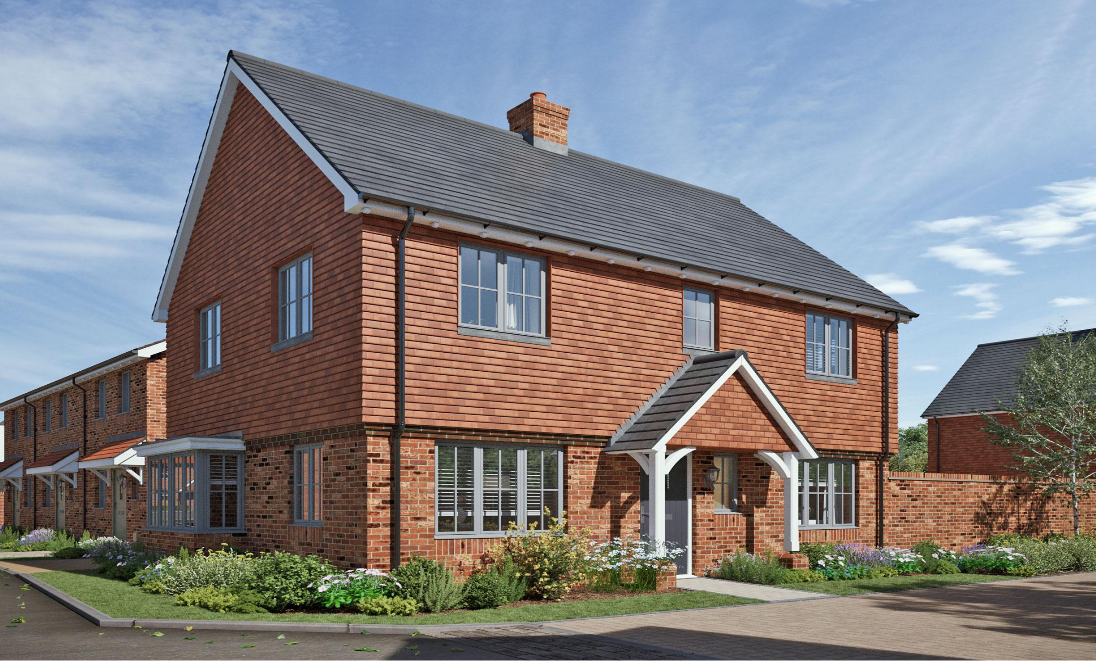
The Bolderwood Brockhills Lane, New Milton BH25 5QL