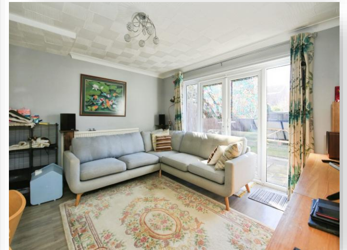
Bellmans Close, Whittlesey PETERBOROUGH PE7 1TU