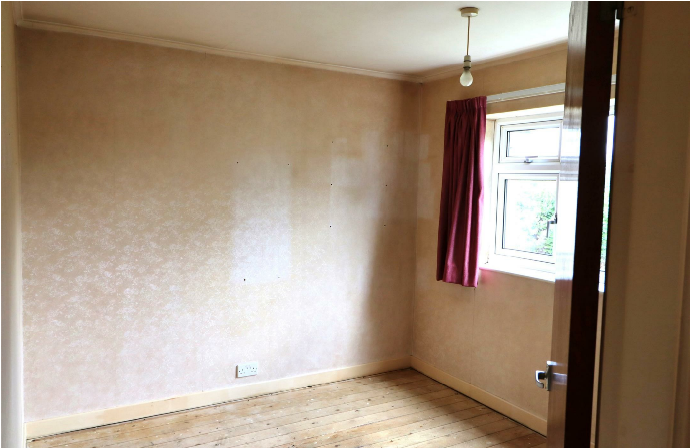
8 Cornwall Close, Warwick, CV34 5HX