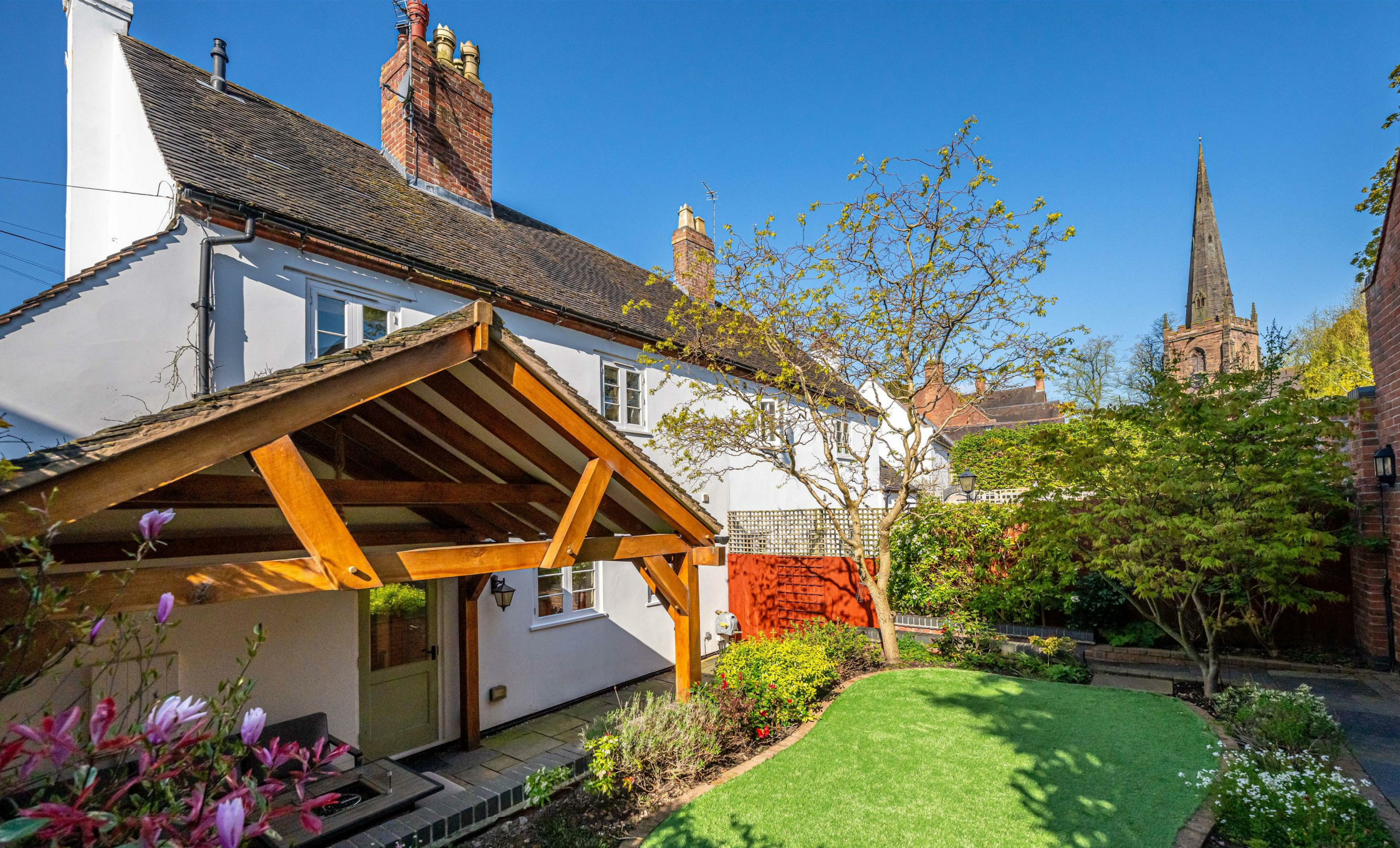
Admiral House, 21a Dean Street, Brewood, Stafford, ST19 9BU