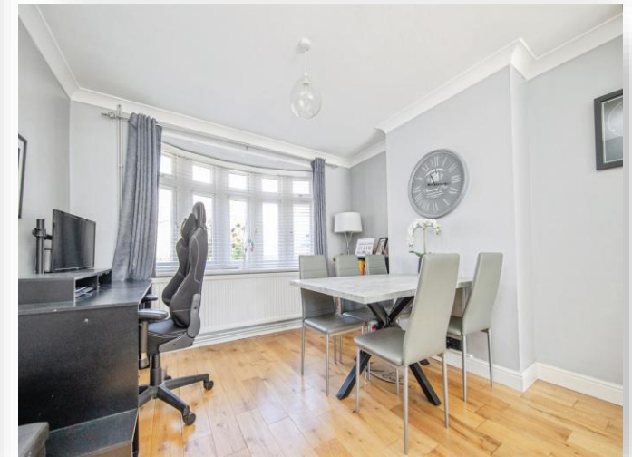
Pitcairn Road, Ipswich, IP1 5BX