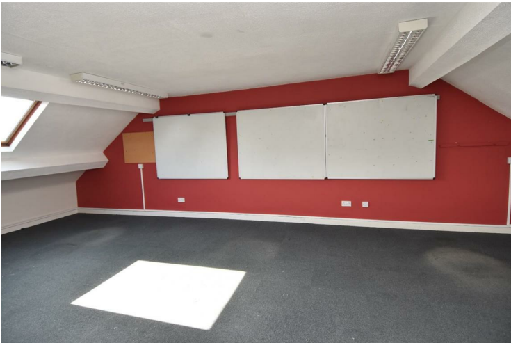
First floor office - 3.860 x 2.875 (photo attached)

The offices are located to the first and second floors approached over an enclosed staircase to a first and second floor landing.