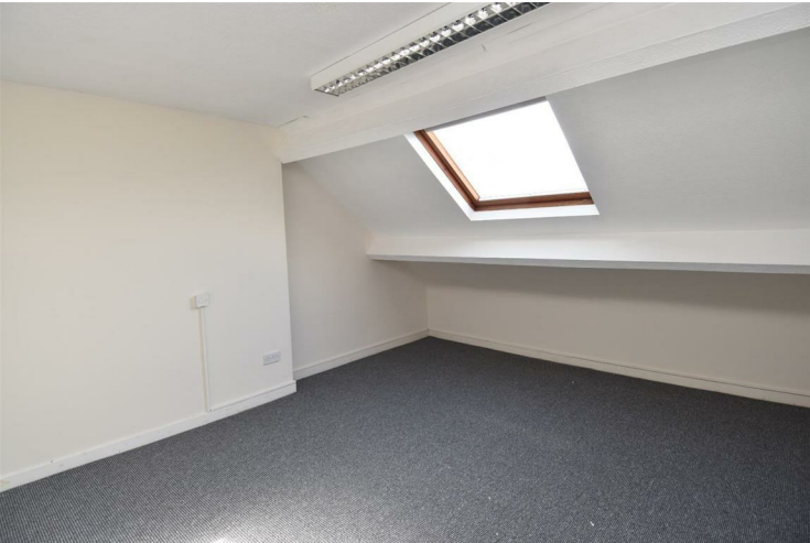
Second floor office - 8.924 x 4.745