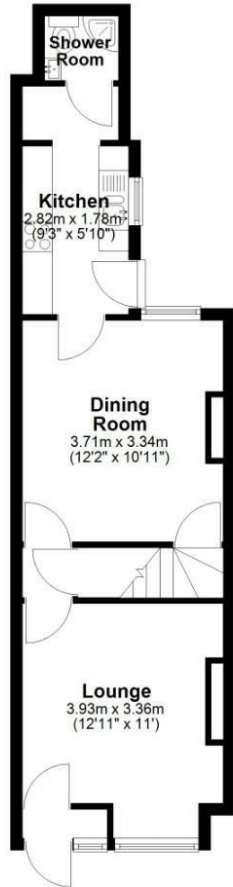
Ground Floor Approx. 37.2 sq. metres (400.4 sq. feet)