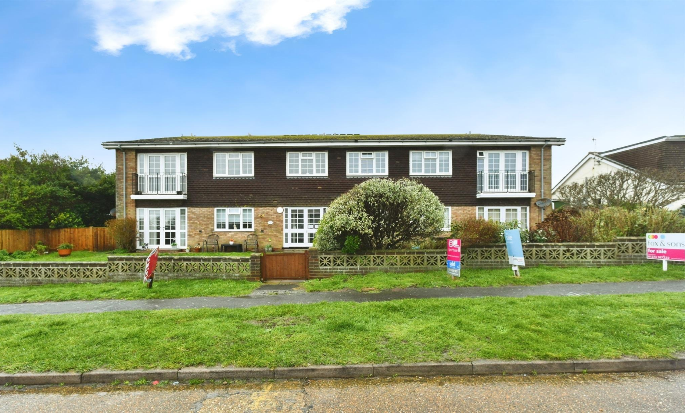
Marsden Court Ambleside Avenue, Telscombe Cliffs Peacehaven BN10 7LS