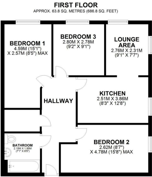
TOTAL AREA: APPROX. 63.8 SQ. METRES (686.8 SQ. FEET) 146 MOSQUITO WAY, HATFIELD