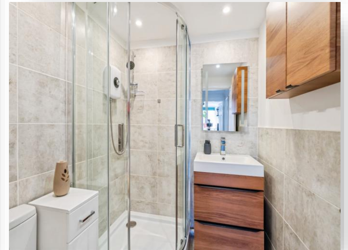
Gibson Way, Bognor Regis PO21 1AW