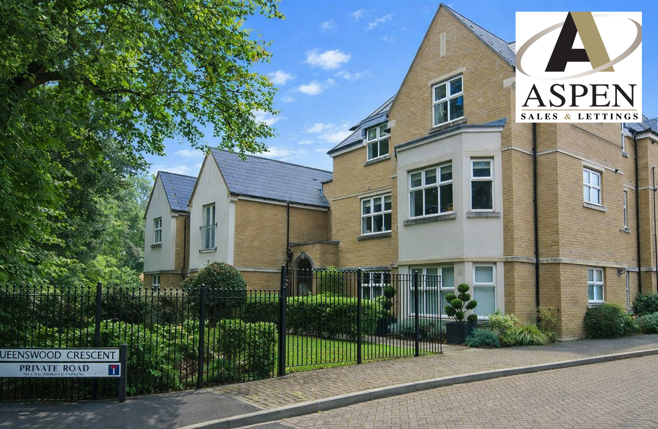
Dorney House Queenswood Crescent, Egham, TW20 0AS