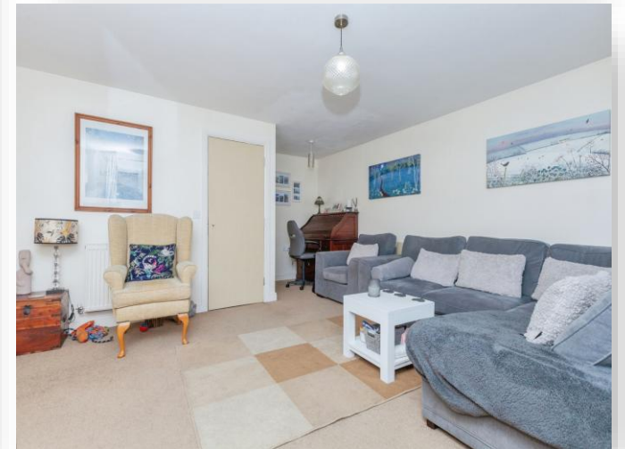
Bannister Road, Leicester LE3 2XS