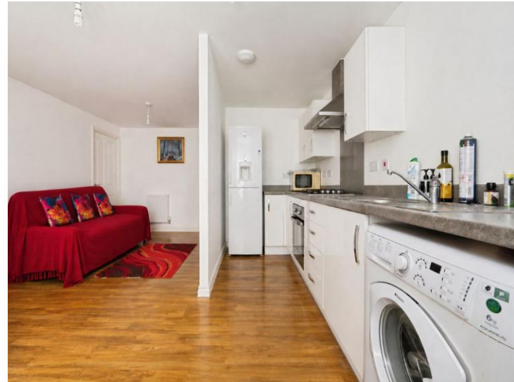
Bakers Crescent, Eastleigh. SO50 9QT