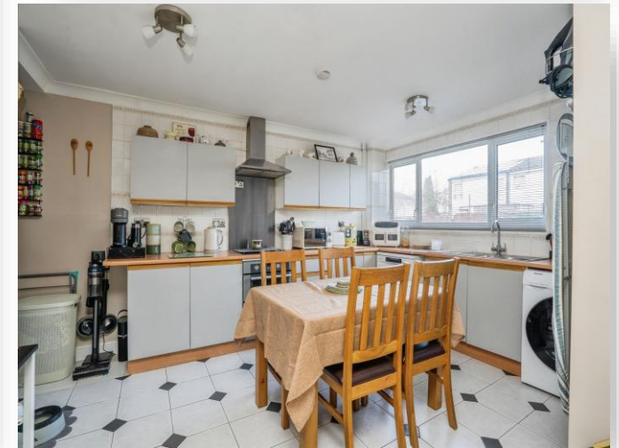
Robin Gardens, WATERLOOVILLE PO8 9XE