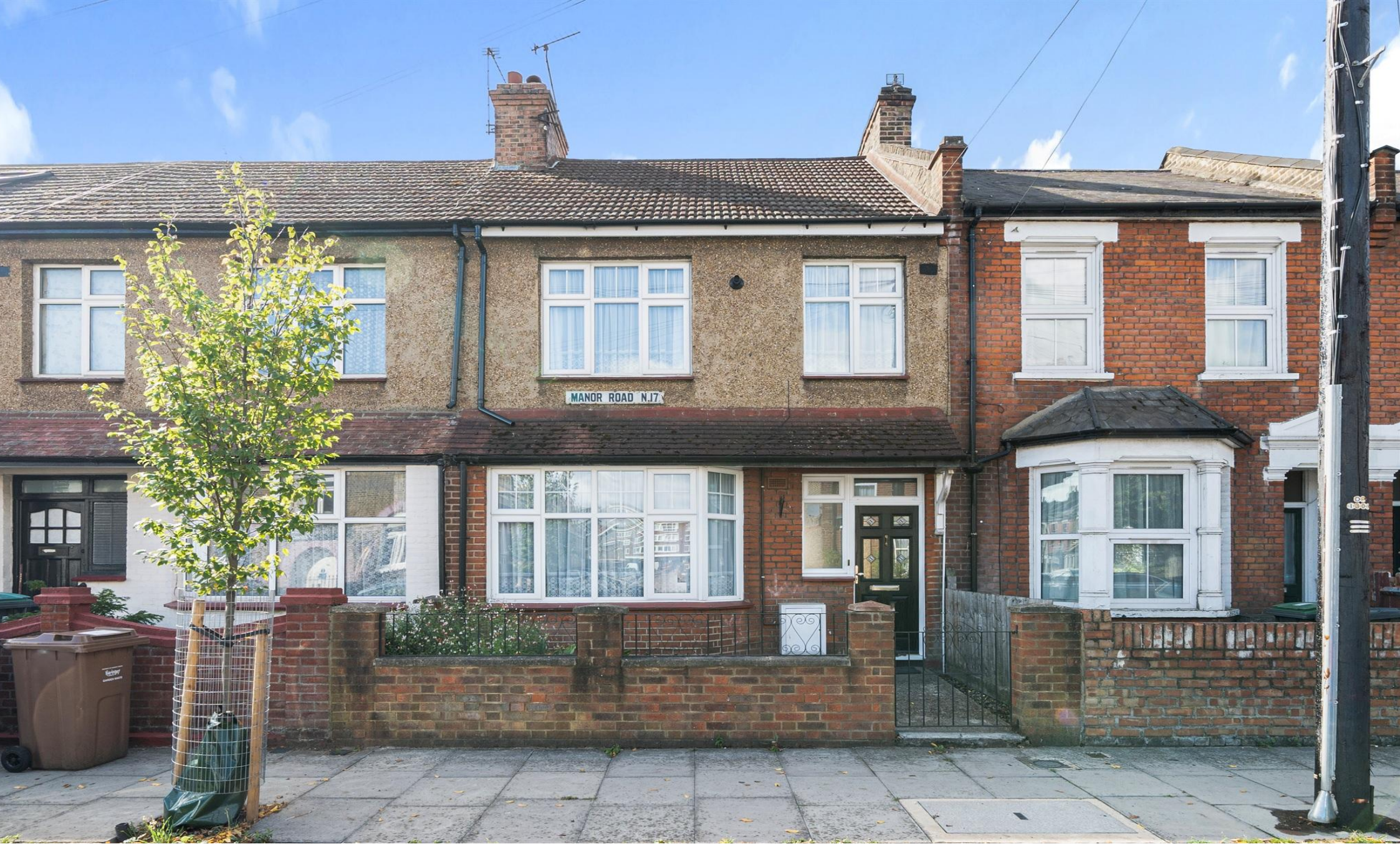
Manor Road, London, N17 0JH