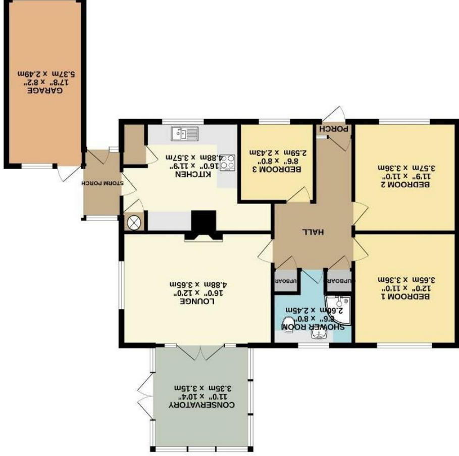
GROUND FLOOR 1122 sq.ft. (104.3 sq.m.) approx.

Whilst every attempt has been made to ensure the accuracy of the floorplan contained herein, measurements of rooms, windows, doors, etc. are taken by hand and should be used as a guide only. The floorplan is for illustrative purposes only and should not be used as a contract of sale. The services, systems and appliances shown have not been tested and no guarantee as to their operability or efficiency can be given. Made with Metrixx, 2025.