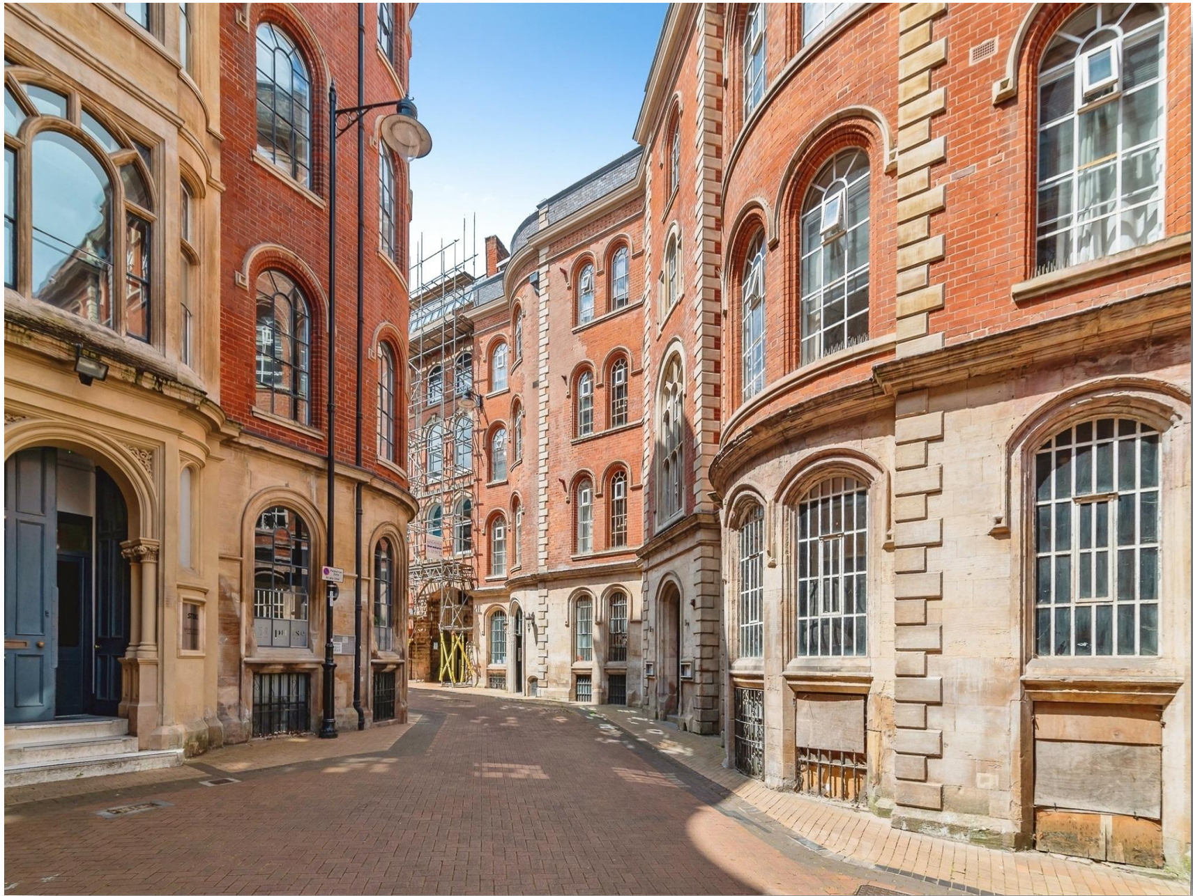
The Establishment Broadway, Nottingham NG1 1PR