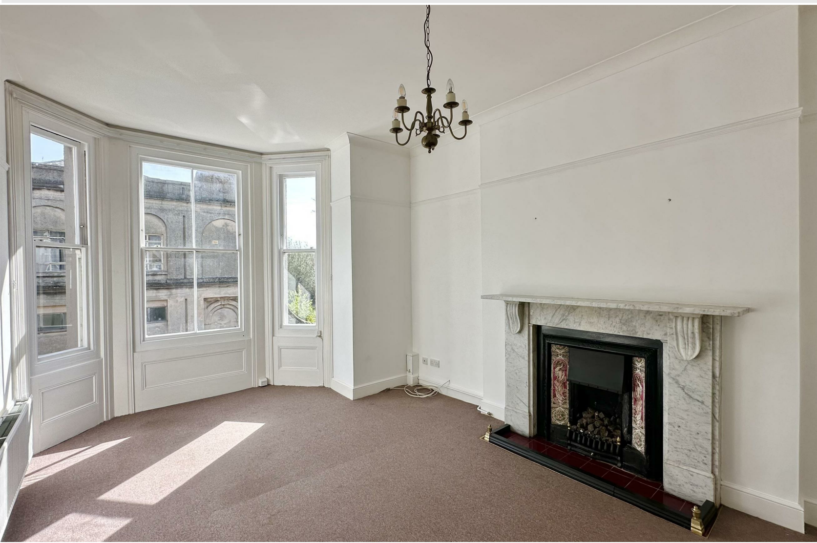
First Floor Flat 16 Magdalen Road, St. Leonards-On-Sea, TN37 6EP