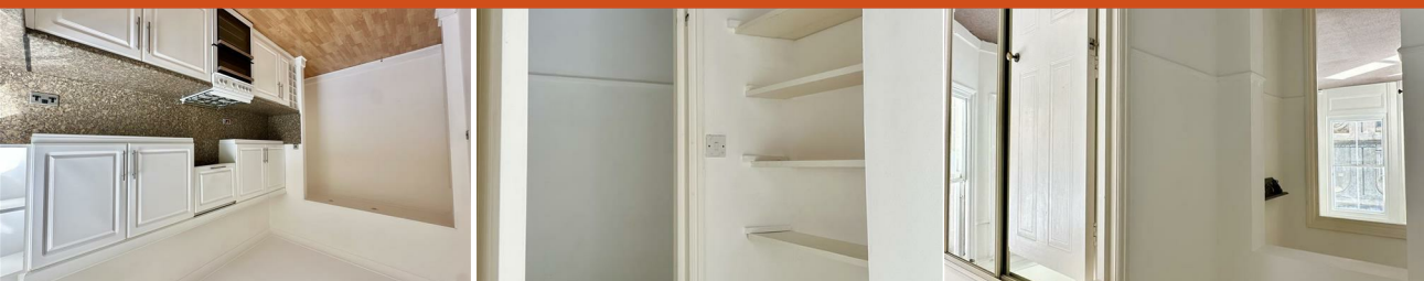
First Floor Flat 16 Magdalen Road, St. Leonards-On-Sea, TN37 6EP