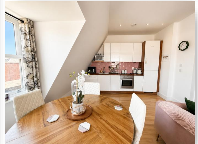
The Salthouse Apartments Salt Meat Lane, Gosport PO12 1GH