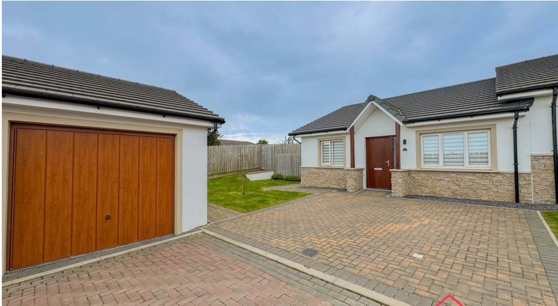
20 Mylchreest Drive, Reayrt Mie, Ballasalla, Isle of Man, IM9 2BB Asking Price £395,000