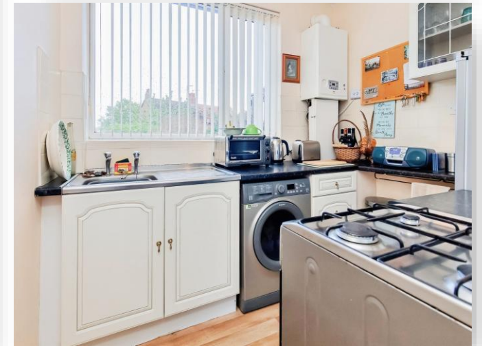
Ruskin Road, Northampton NN2 7TA