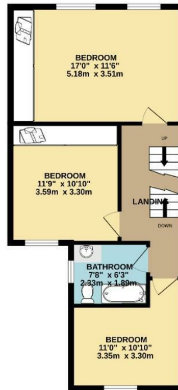
1ST FLOOR 554 sq.ft. (51.5 sq.m.) approx.