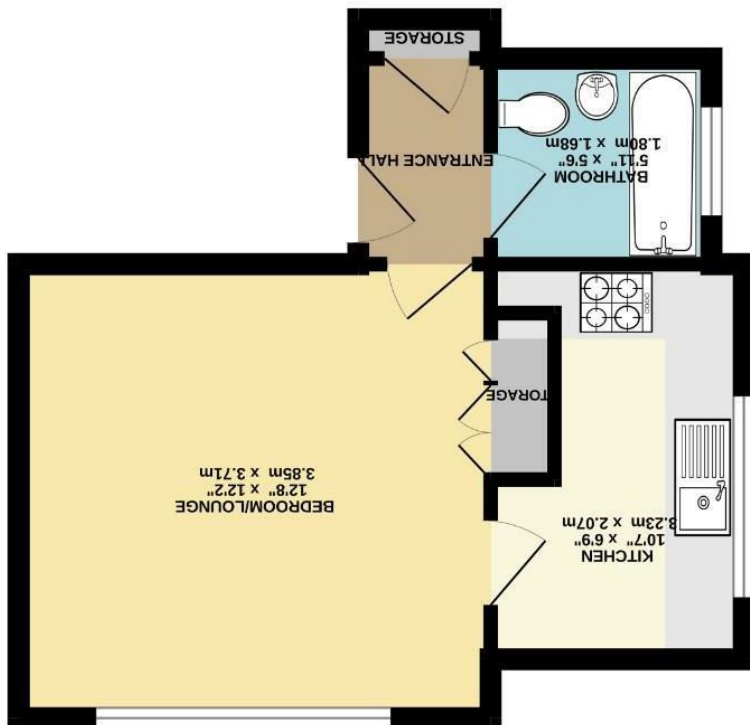
GROUND FLOOR 281 sq. ft. (26.1 sq. m.) approx.

TOTAL FLOOR AREA - 281 sq. ft. (26.1 sq. m.) approx. Measurements are approximate. Not to scale. Measure for your own use.