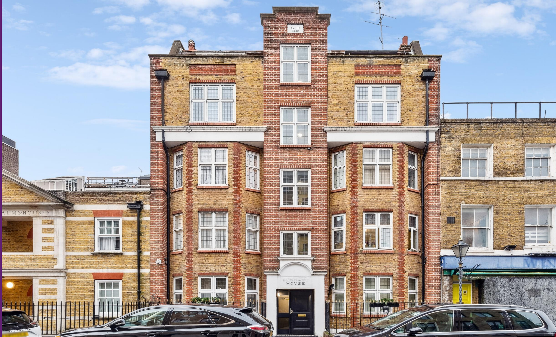
Gerrard House Marylebone, W1H