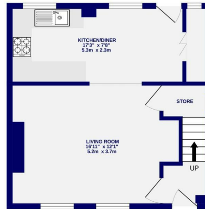
GROUND FLOOR 381 sq.ft. (35.4 sq.m.) approx.