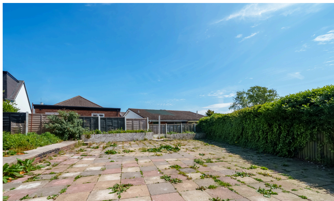
Farm Hill, Brighton, BN2 6BH Asking Price £545,000