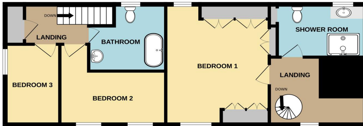
TOTAL FLOOR AREA : 112.7 sq.m. (1213 sq.ft.) approx.

Whilst every attempt has been made to ensure the accuracy of the floorplan contained here, measurements of doors, windows, rooms and any other items are approximate and no responsibility is taken for any error, omission or mis-statement. This plan is for illustrative purposes only and should be used as such by any prospective purchaser. The services, systems and appliances shown have not been tested and no guarantee as to their operability or efficiency can be given. Made with Metropix ©2026