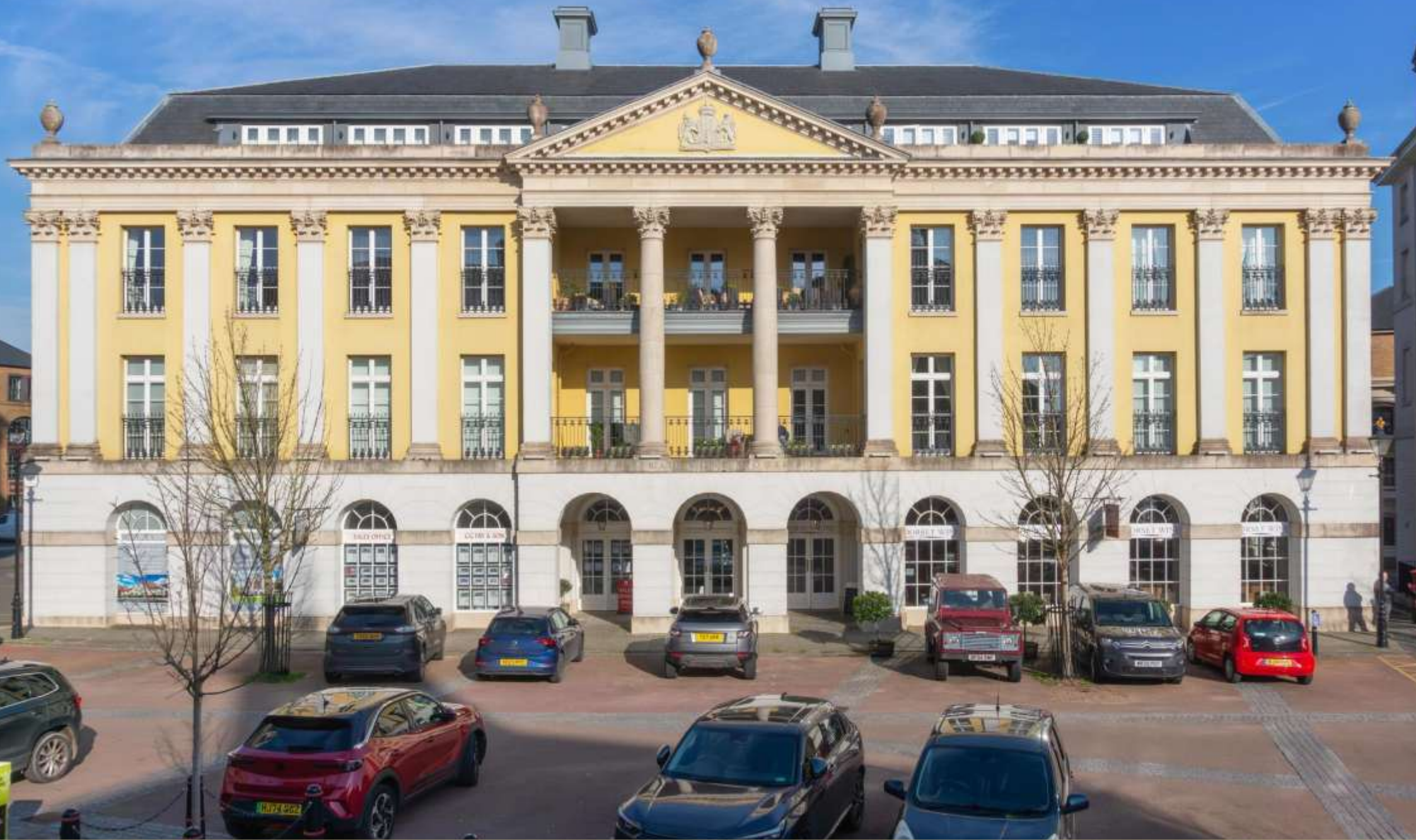
Strathmore House Poundbury Price Guide £700,000