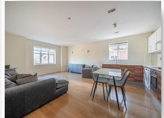
18 Imperial Place, Shoppenhangers Road, Maidenhead SL6 2GN