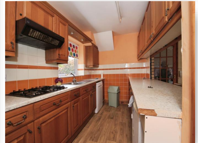
Chestnut Avenue, Peterborough PE1 4NT