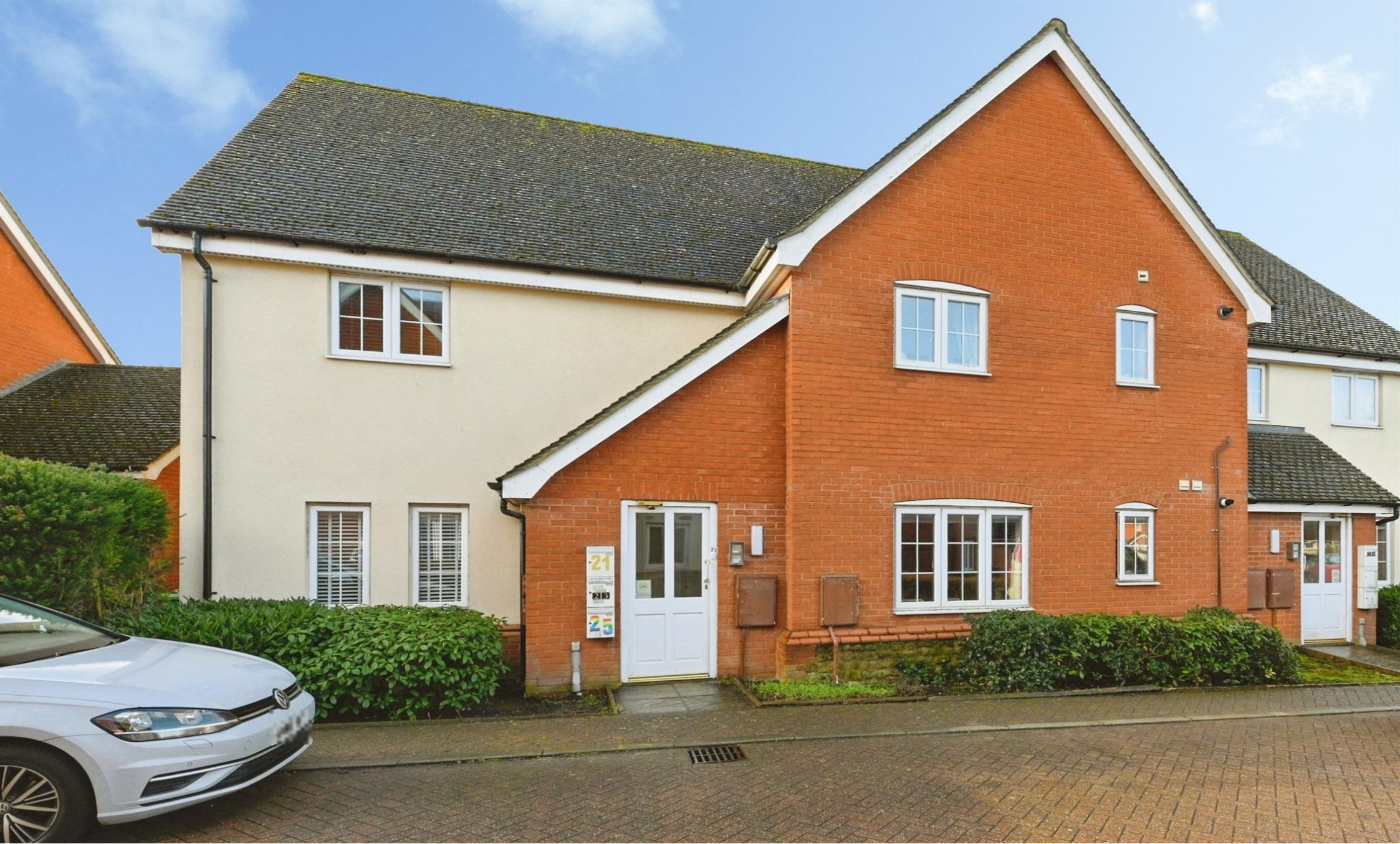
Tyrrell Crescent, South Wootton, King's Lynn, PE30 3QL