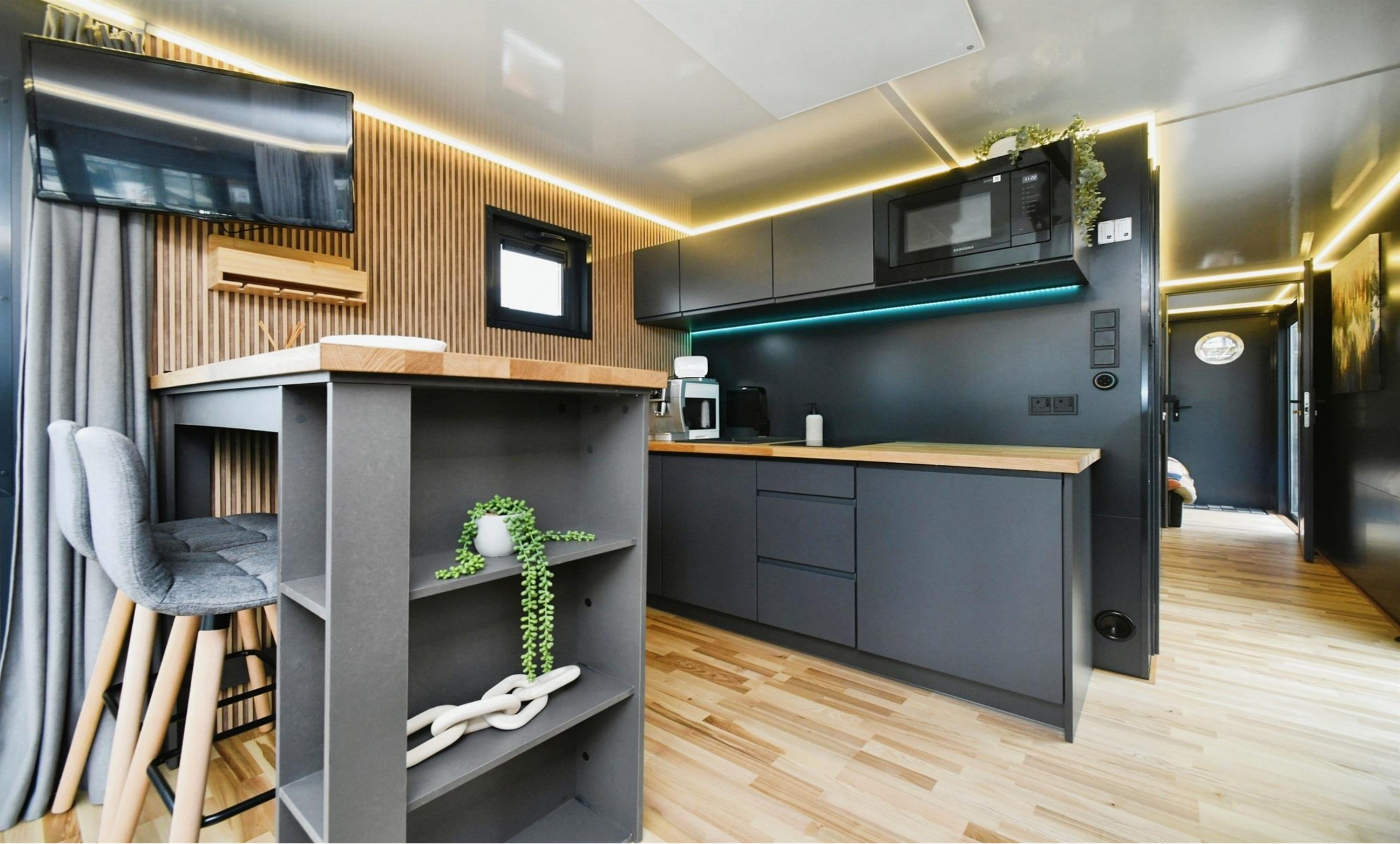
The Boatyard Robinson Road, Newhaven BN9 9BL