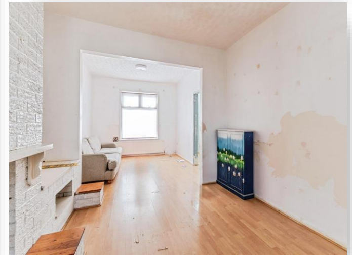
Alcombe Road, Northampton NN1 3LE