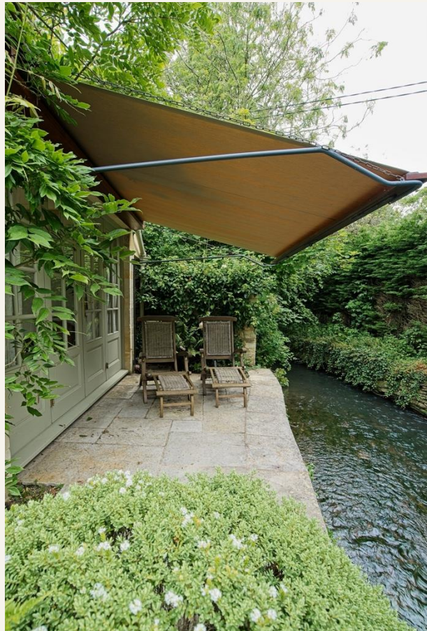
PEACEFUL RIVER ACCESS

Additional benefits include a garage, a luxurious summer house suitable for year-round use, and private river access, creating an ideal blend of comfort, practicality, and outdoor lifestyle.