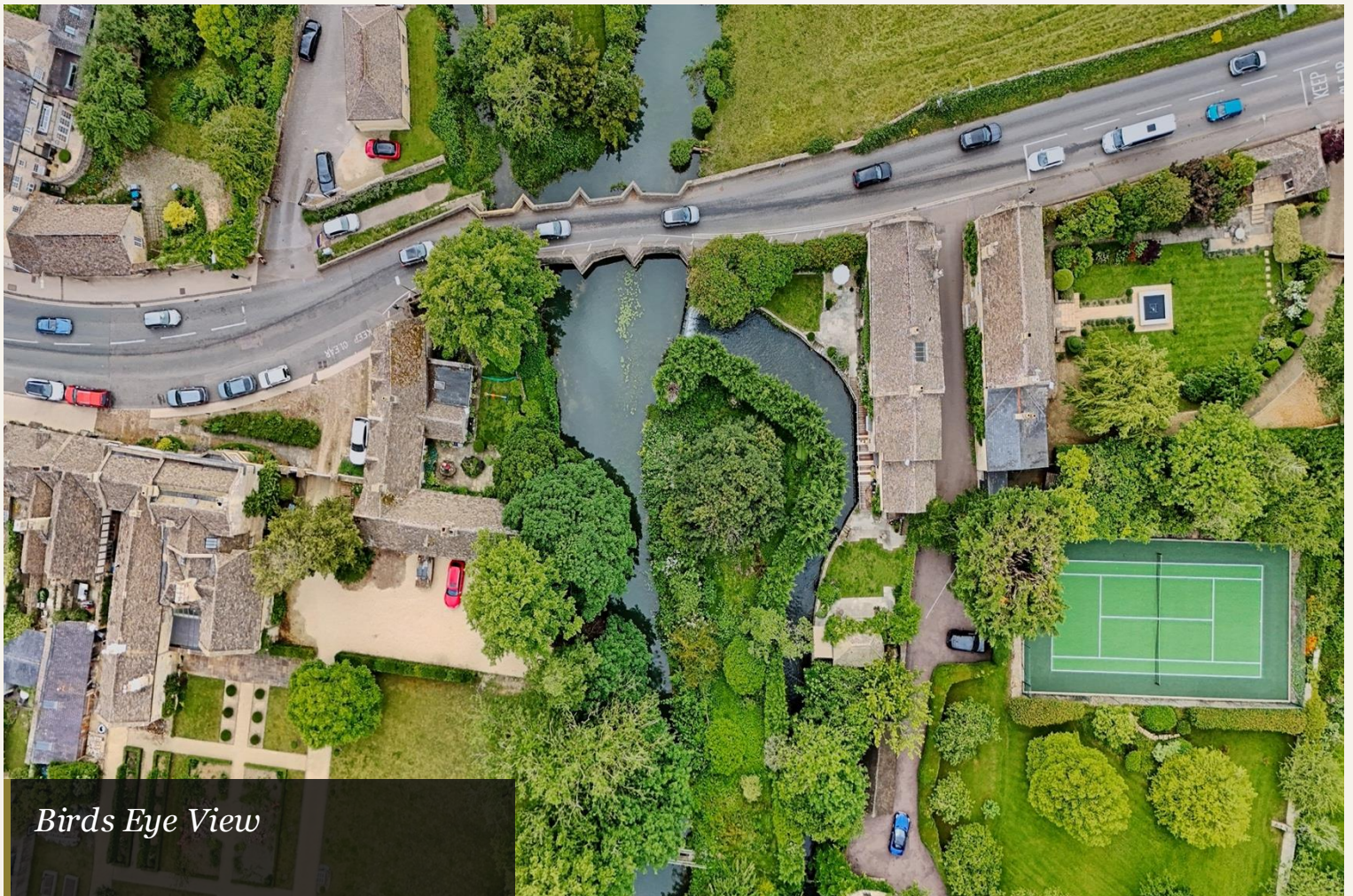
Birds Eye View