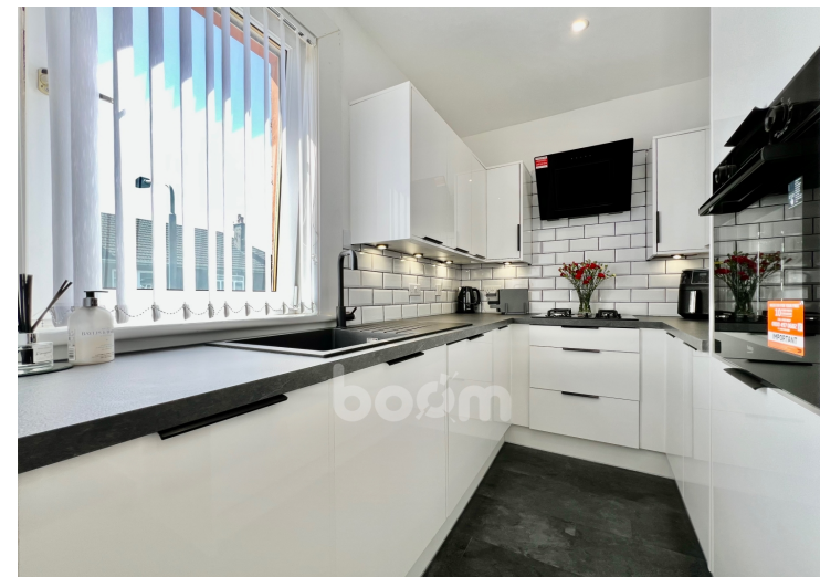
Barrie Terrace, Ardrossan