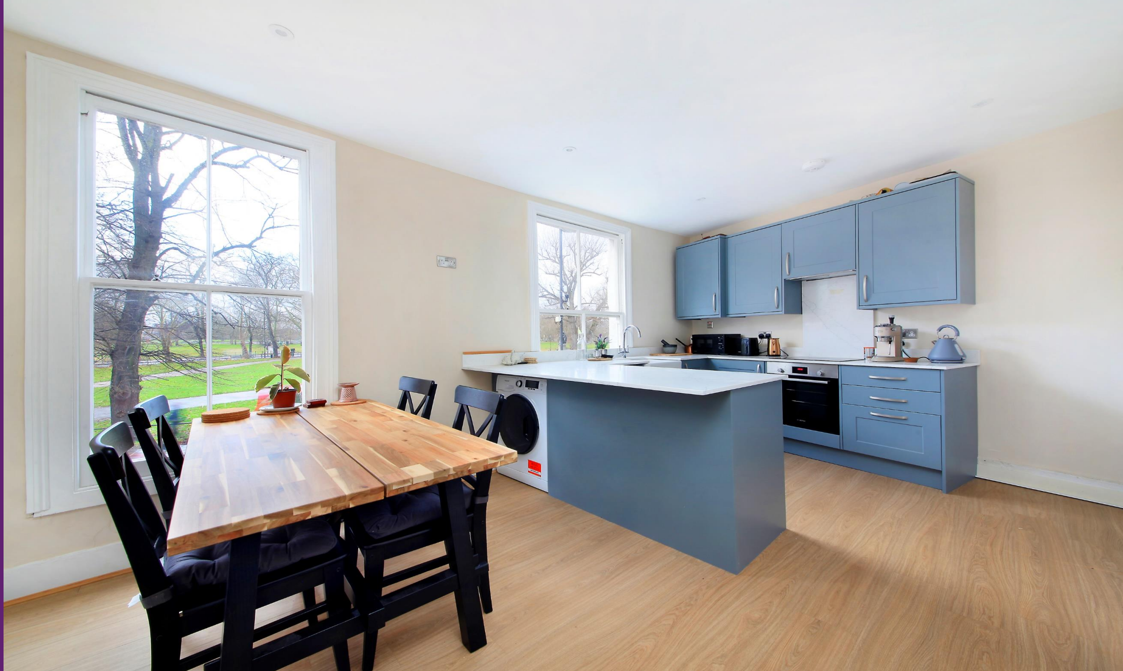
The Pavement Clapham Common, SW4