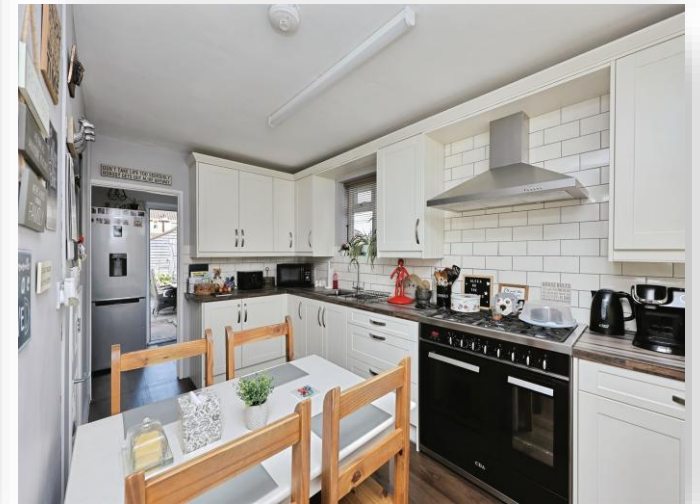
Rider Haggard Road, Norwich, NR7 9UQ