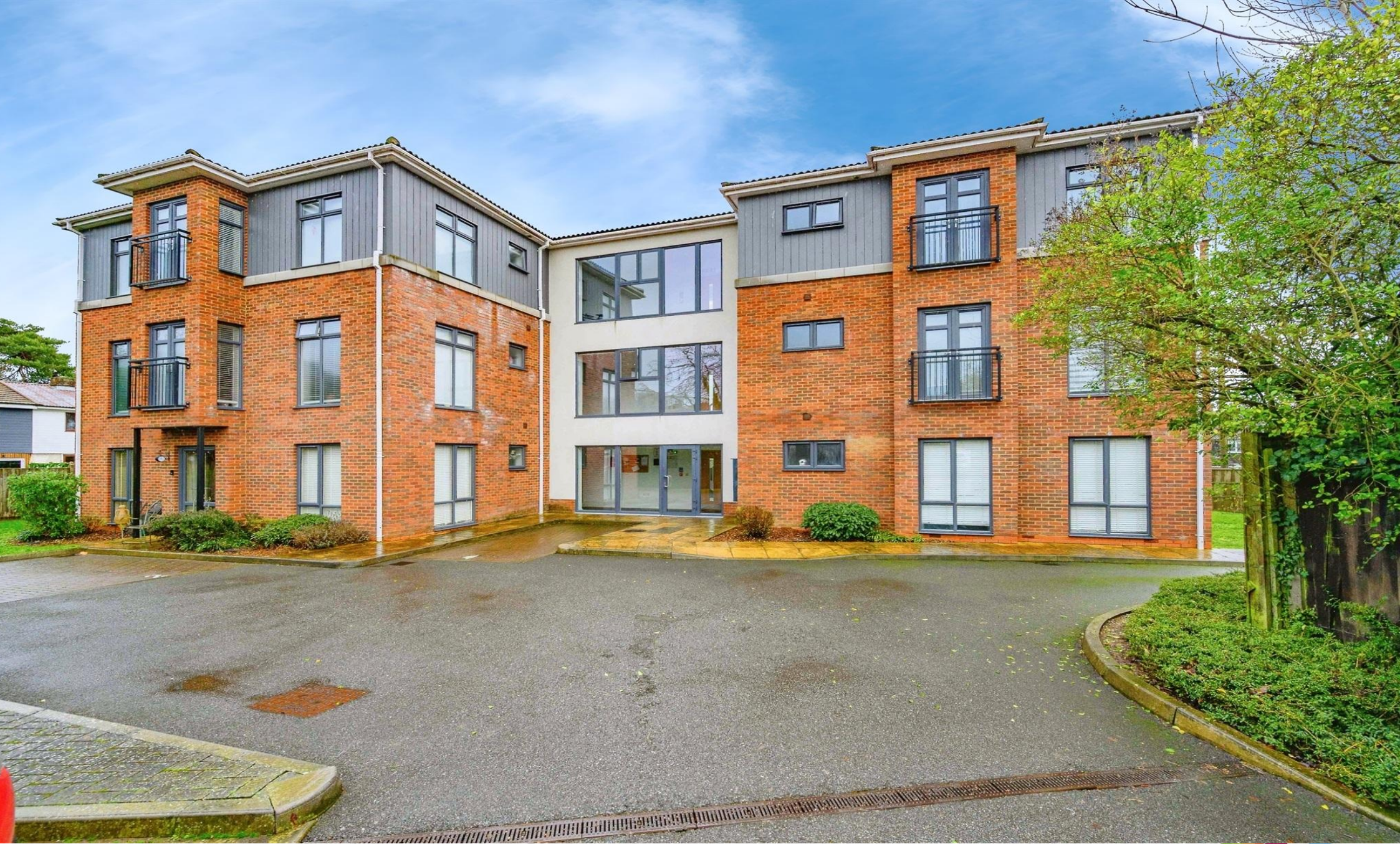
Sherpa House Montgomery Avenue,HEMEL HEMPSTEAD HP2 4HD