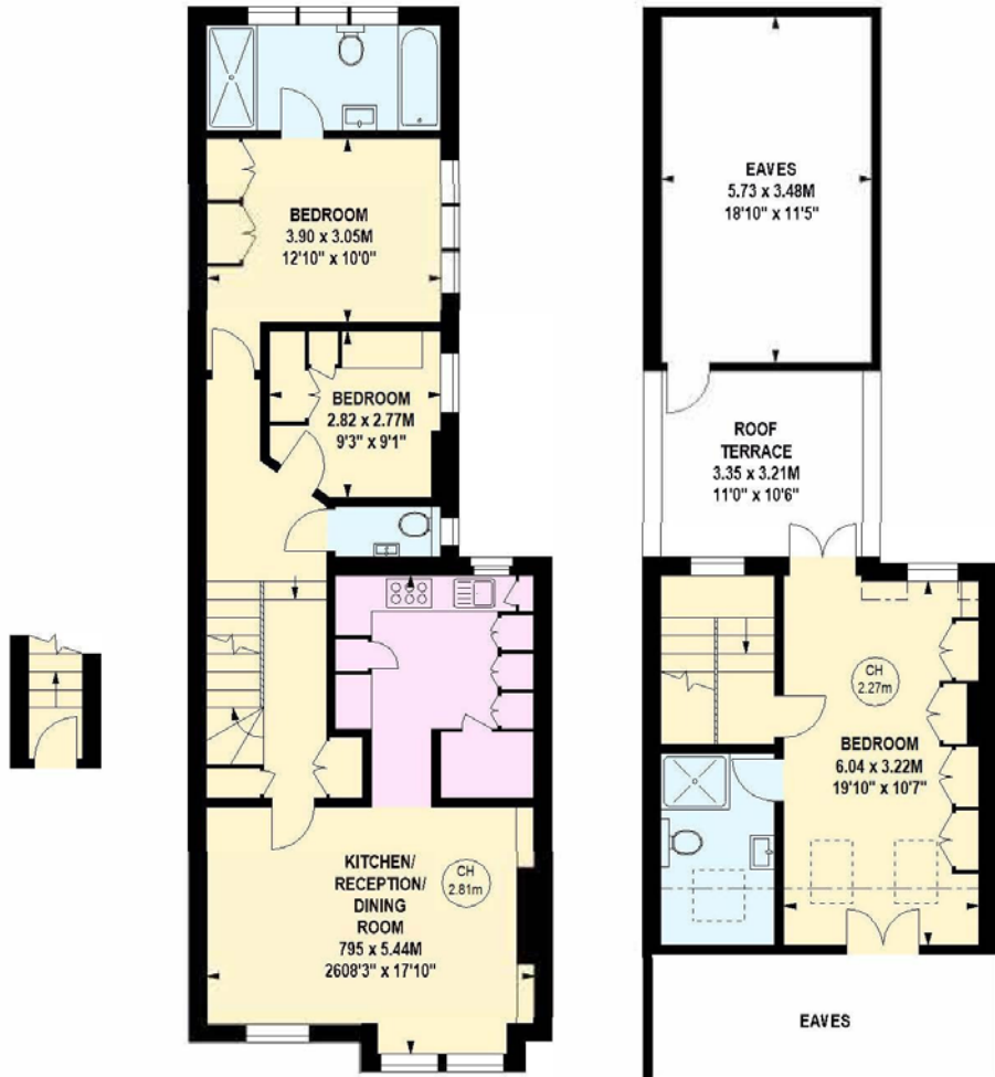
Ground Floor Entrance