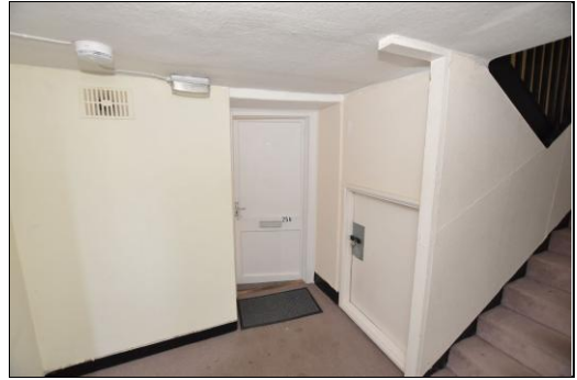
Communal Entrance Hall