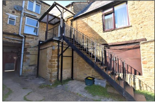
External staircase in Mews