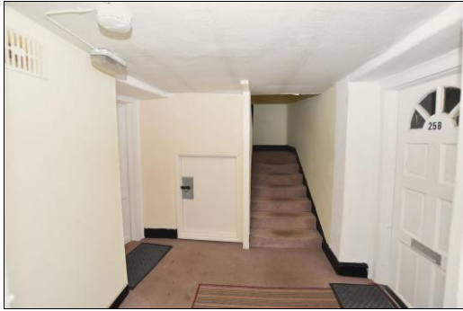
Communal Entrance Hall