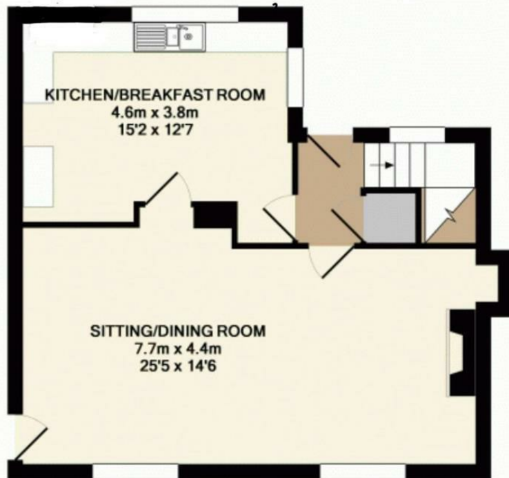
GROUND FLOOR APPROX. FLOOR AREA 52.5 SQ.M. (565 SQ.FT.)