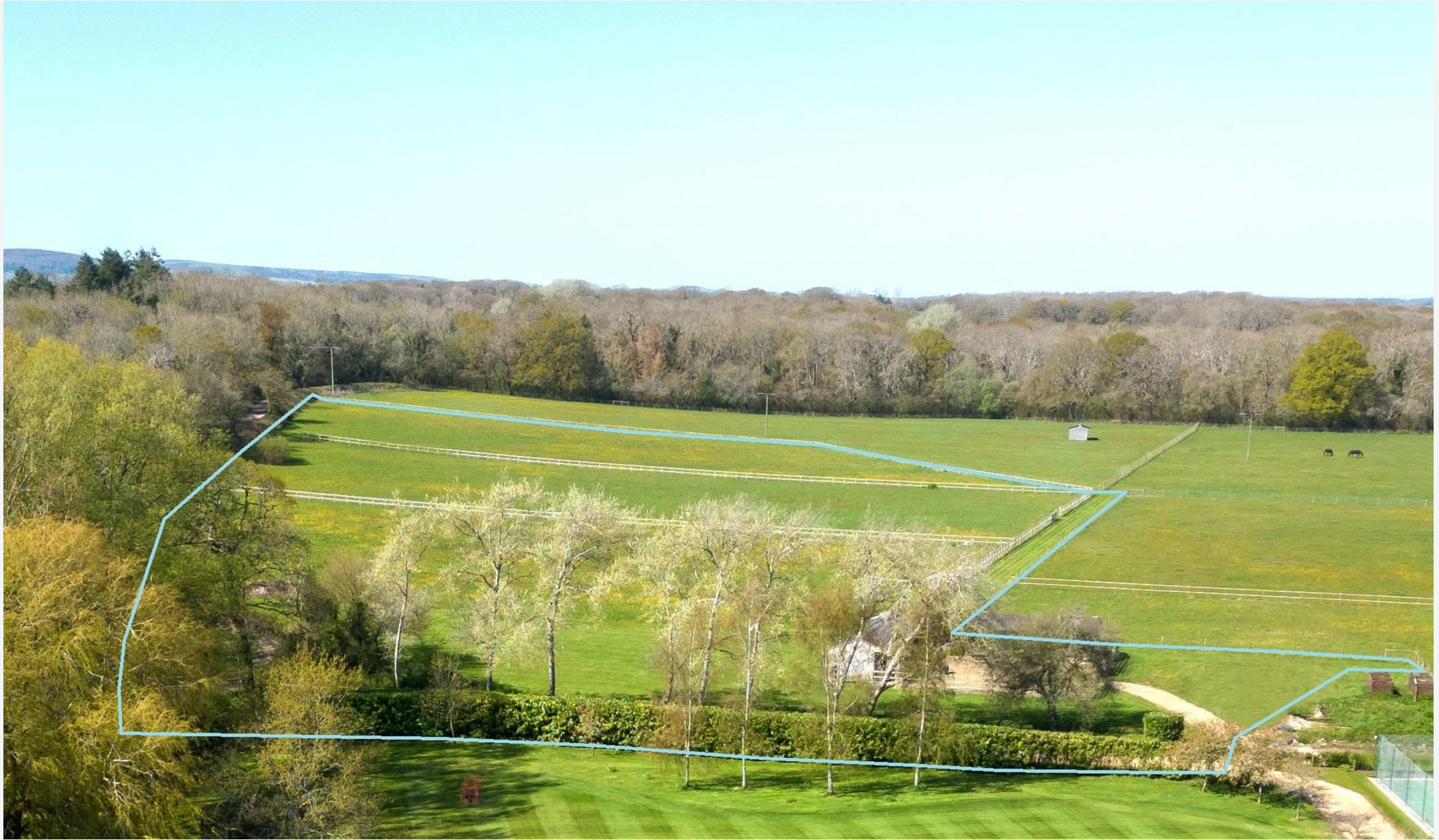
Land At Watchingwell, Calbourne, Isle of Wight