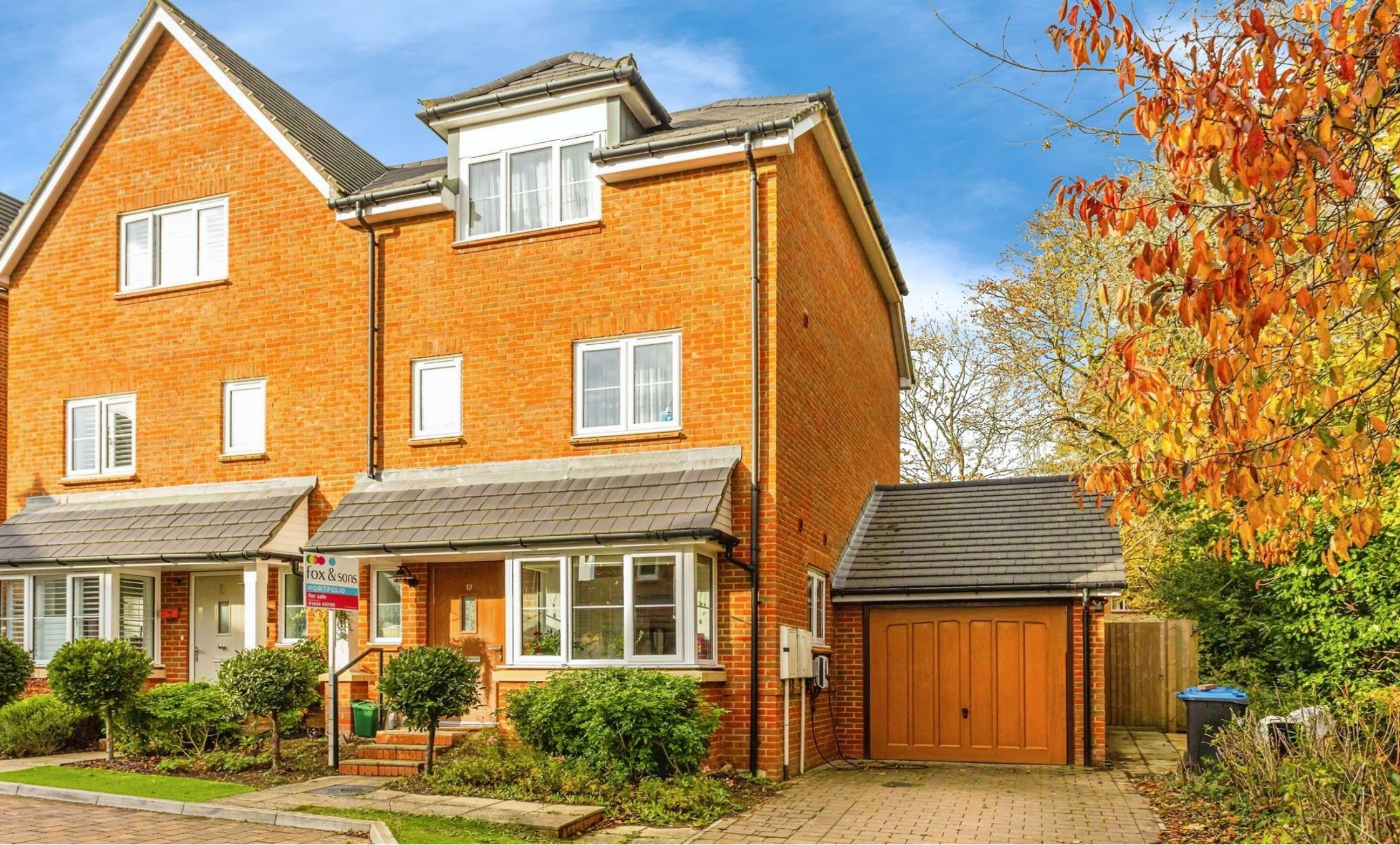
Little Pithfield, Haywards Heath RH16 4WB