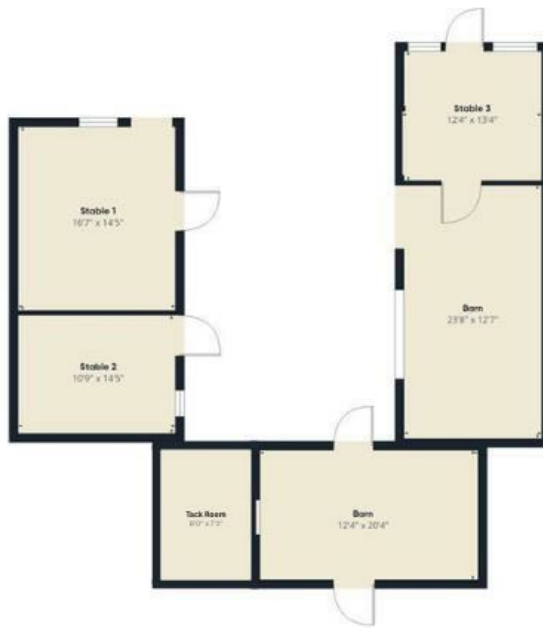
Floor 0 Building 4

Approximate total area (1) 3442 ft 2 Reduced headroom 10 ft 2