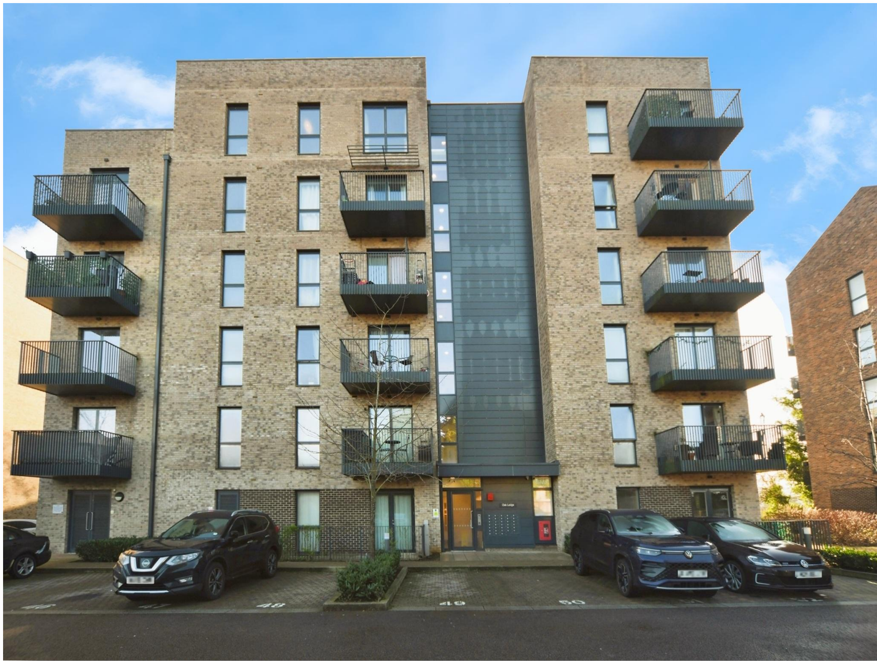
Oak Lodge, Riverwell Close, Watford, WD18 0GZ