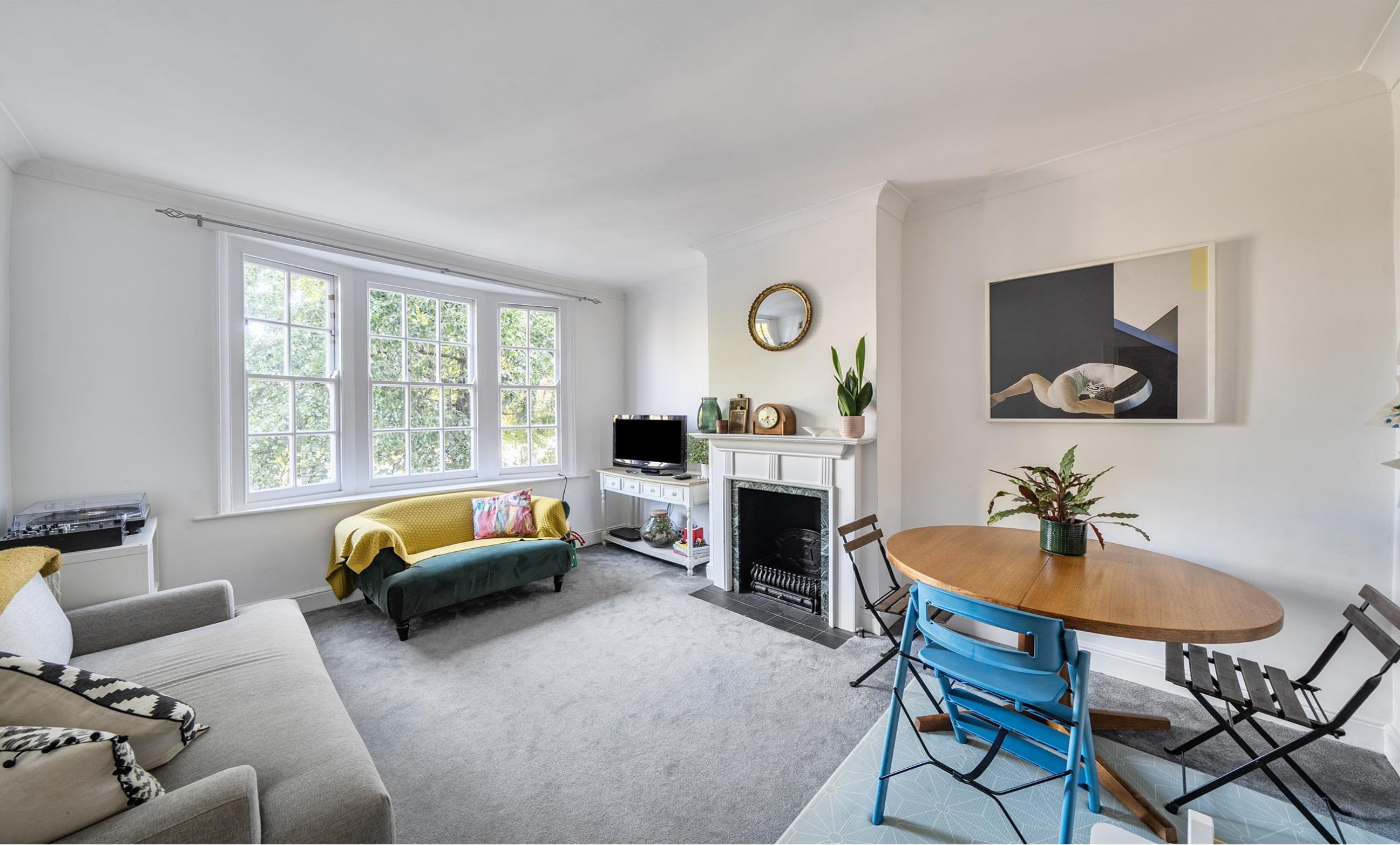
Kenmure Mansions, Pitshanger Lane, London, W5 1RJ