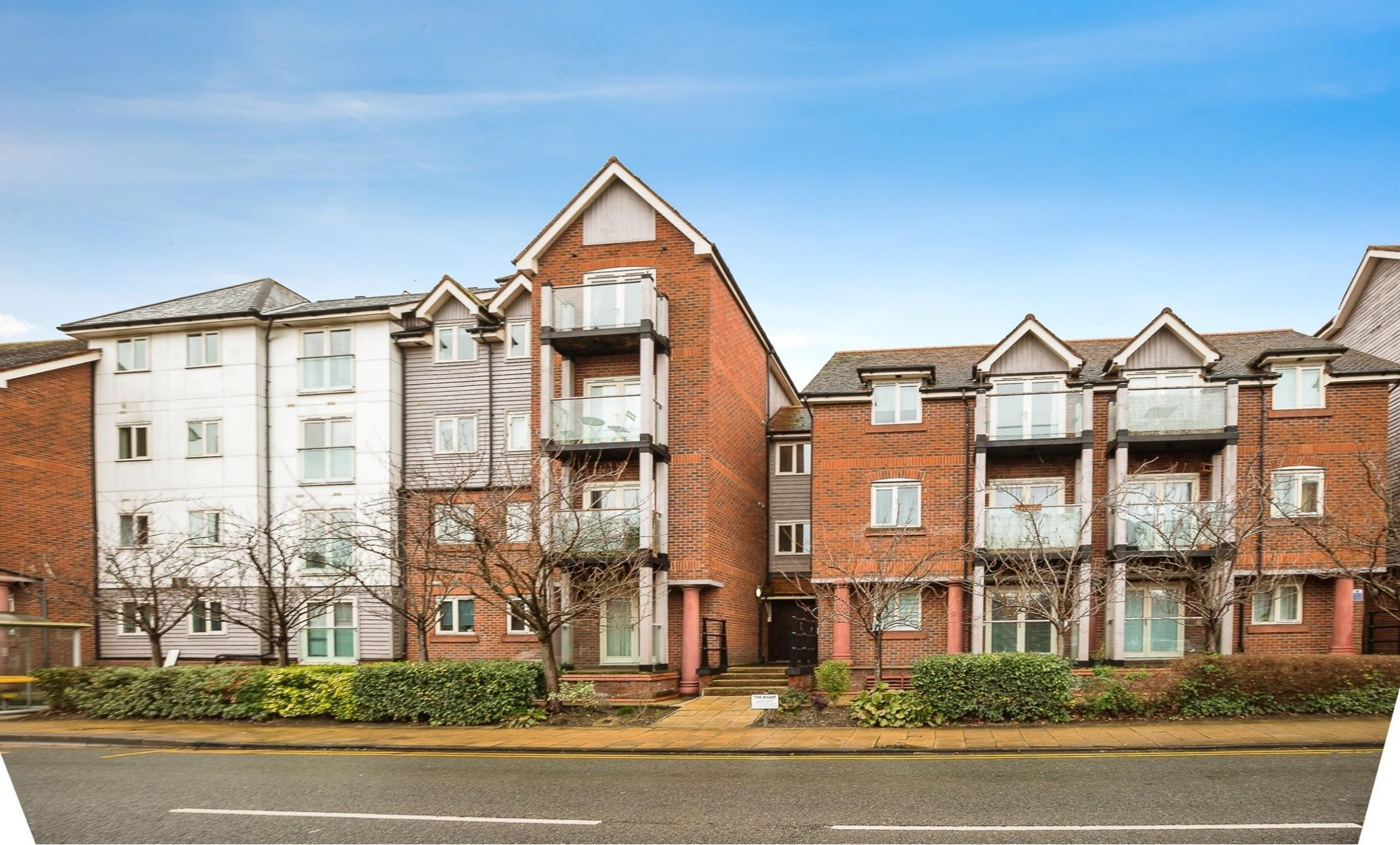
The Wharf New Crane Street, Chester CH1 4HZ