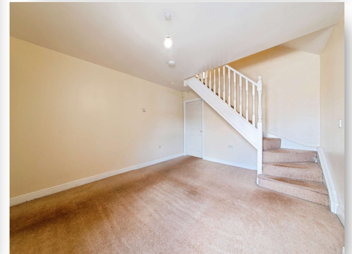
Juniper Way, Sleaford NG34 7GP