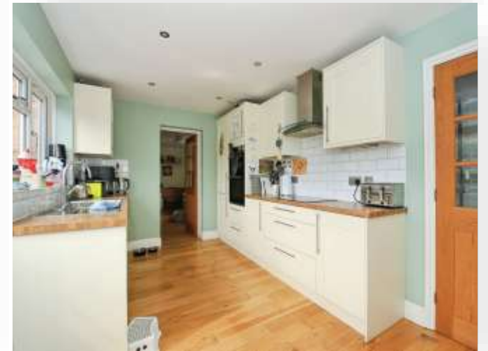
Norman Drive, Stilton Peterborough PE7 3RS