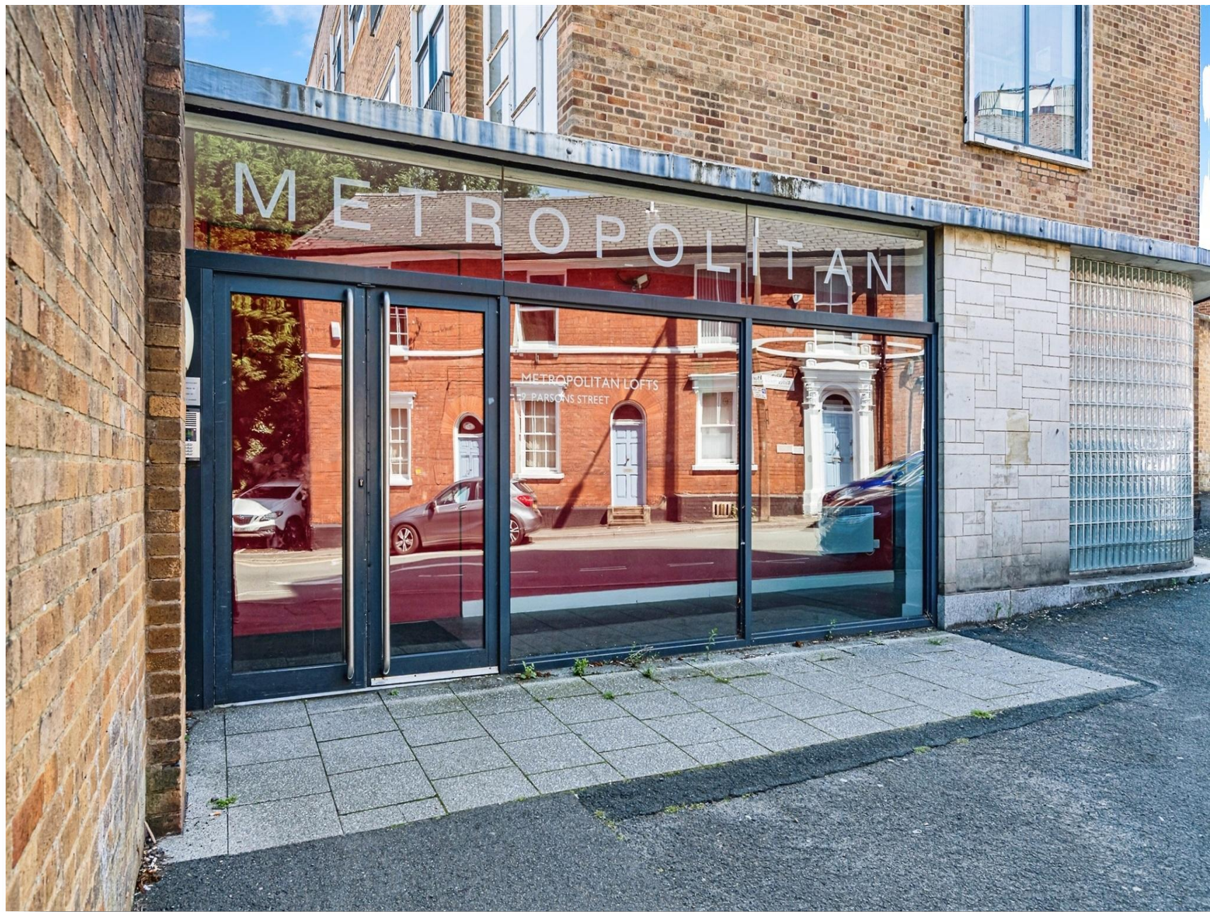
Metropolitan Lofts Parsons Street, Dudley, DY1 1JE